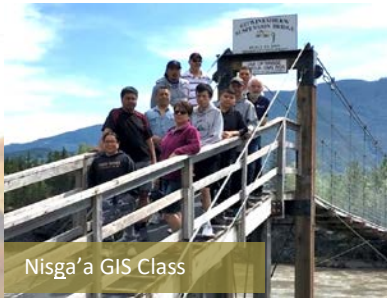
Nisga'a GIS Class

Stay tuned for an update on what we find.