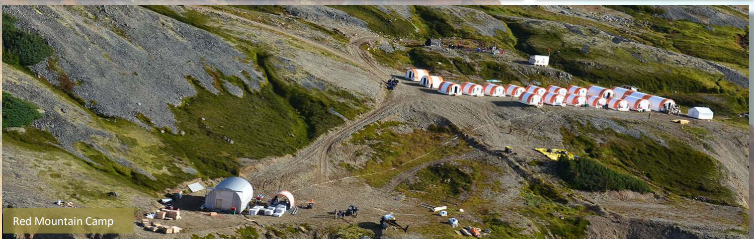
Red Mountain Camp