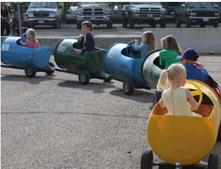
Activities for all ages at the Hudson's Hope Fall Fair