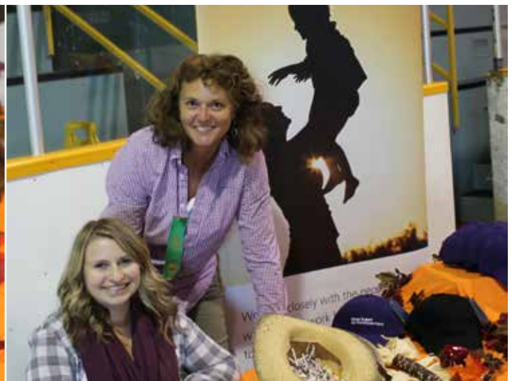
Volunteers from PRGT enjoyed spending the day handing out hats, candy, and chatting with members of the community.