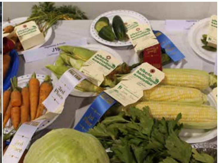
Winning produce from the Hudson's Hope Fall Fair