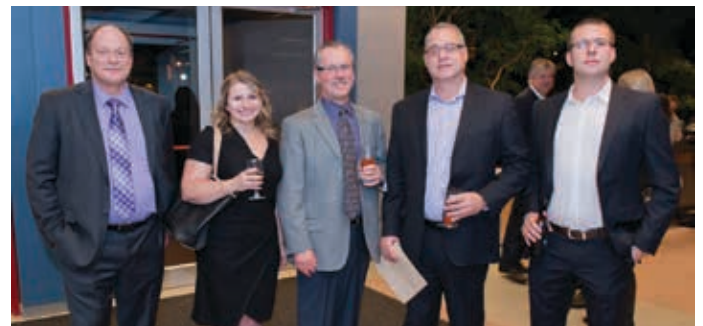
TransCanada project representatives attend the Prince George Chamber of Commerce Business Excellence Awards.

As a member of several British Columbia Chambers of Commerce, PRGT was proud to sponsor Chamber of Commerce Business Excellence Awards events in several communities across the Project corridor this fall. With events in Mackenzie and Prince George attended in October, we're looking forward to attending the event in Terrace on November 22.