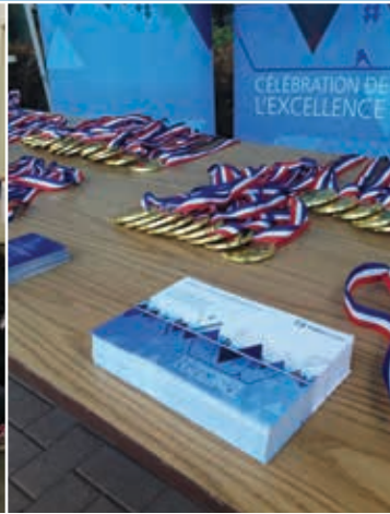
Chocolate gold medals were handed out to all visitors at the TransCanada booth.