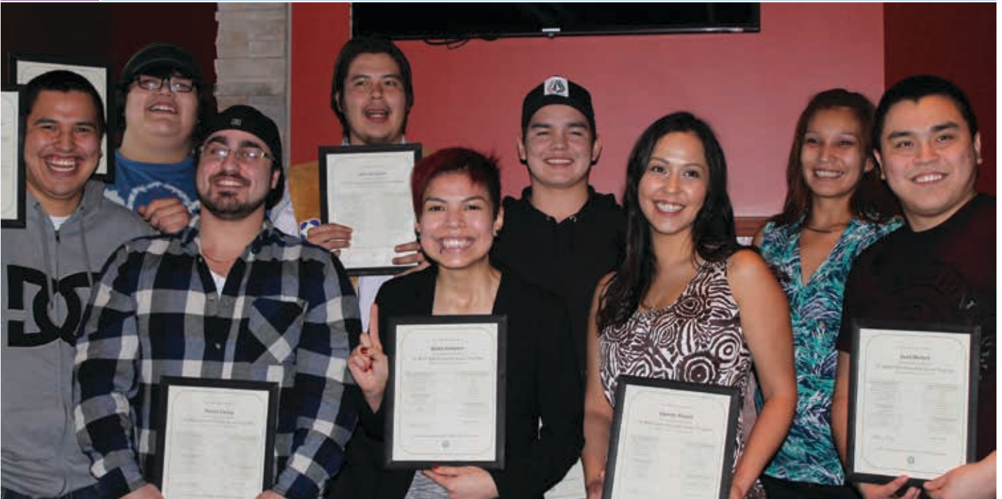
Participants in the PGNAETA: Access to Trades program celebrate their graduation in Prince George.