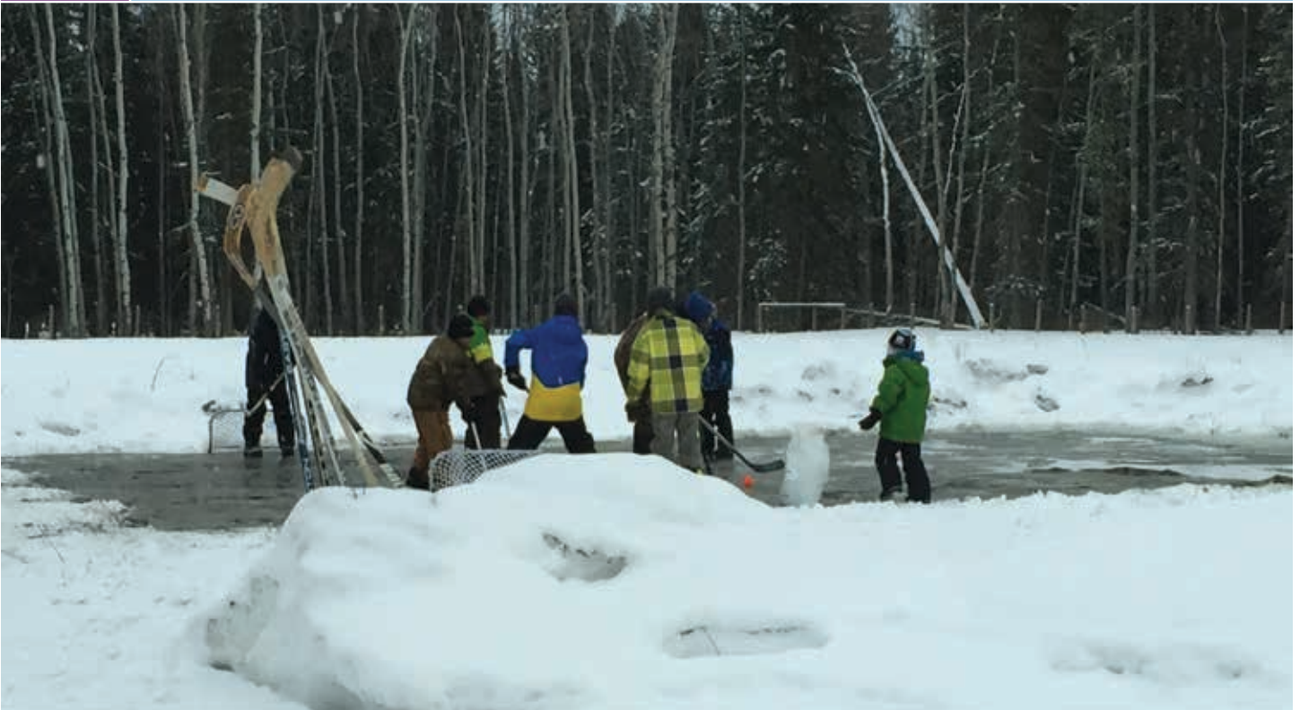
Local hockey players drew a crowd at the 3-on-3 tournament.