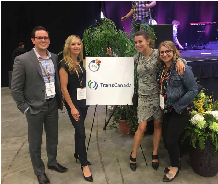
TransCanada's BC projects were a proud sponsor of the 2016 NCLGA AGM and Conference.