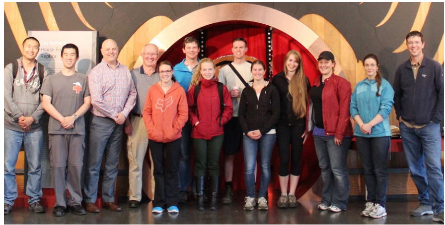
MEDICAL STUDENTS VISIT NISGA'A MUSEUM.

bed tour and of course a tour of the Ancestors' Collection. They also had a traditional Nisga'a meal at the museum before they returned to Terrace (and back to their studies).