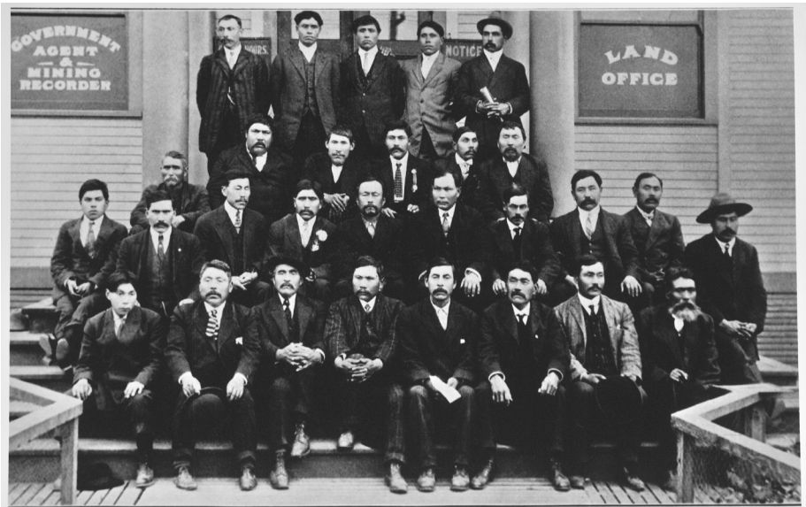
MEMBERS OF THE LAND COMMITTEE OF THE NISGA TRIBE. Photograph taken at Aiyansh, Naas River, upon occasion of a meeting of the Tribe held there in October, 1913.