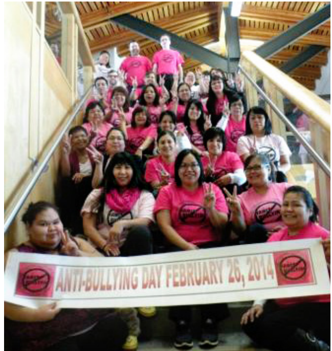
NLG staff in unity for Anti-Bullying Campaign.