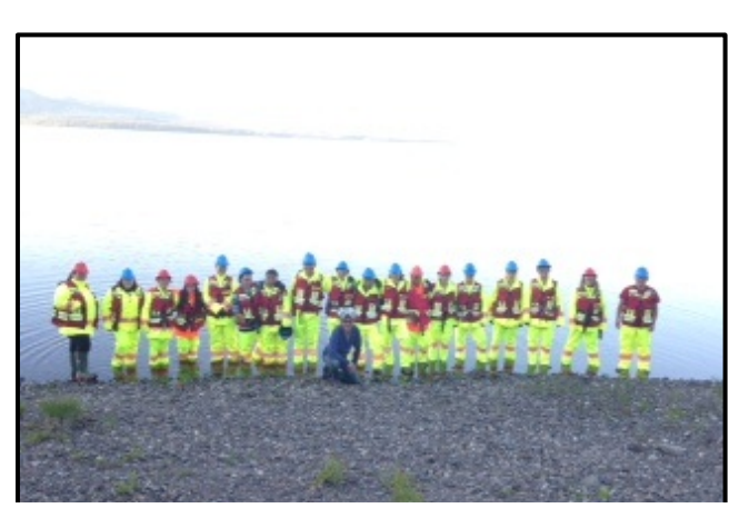
Youth Natural Resources Training Participants, July 2014

This summer PRGT and Geoterra sponsored a First Nations Youth Natural Resources Training and Mentoring Program. During this one month long program, technical pipeline experts and Aboriginal Elders mentored 18 youth from 18 different Aboriginal communities along the project corridor. One Nisga'a citizen participated in this program and received technical pipeline and safety training , as well as traditional teachings from Elders.