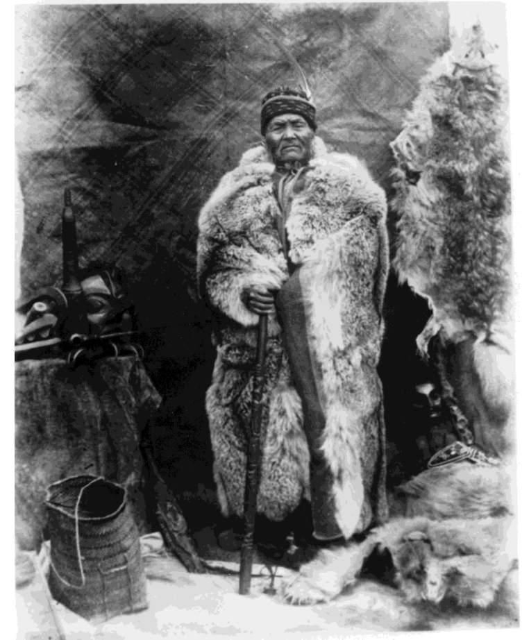
Nisga'a Chief Israel Sgat'iin

1890 – The first Nisga'a Land Committee is established