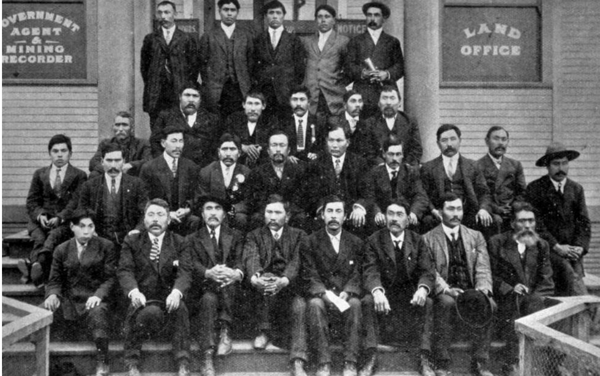
Nisga'a Land Committee 1913

1913 - Nisga'a Land Committee petitions to the British Privy Council in London; they are directed to the Canadian Justice system and are ignored.