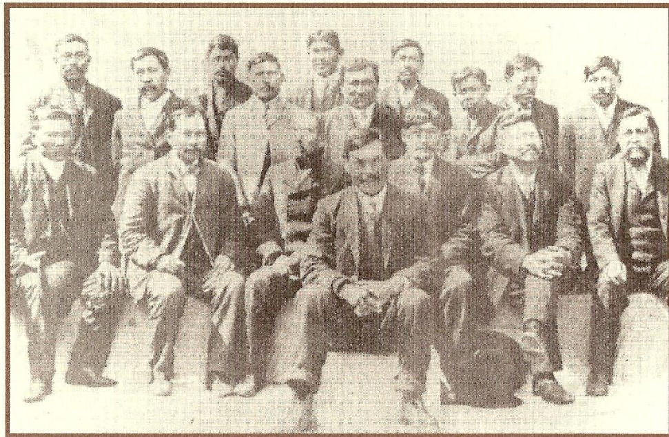
NISGA'A LAND COMMITTEE - 1913