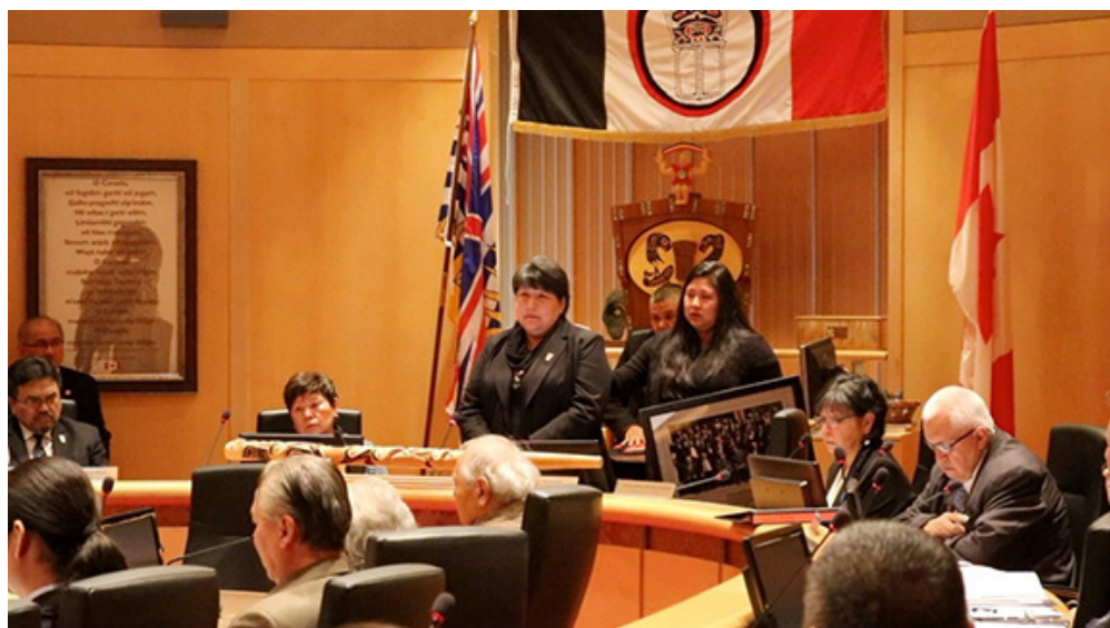
A minute of silence is observed.