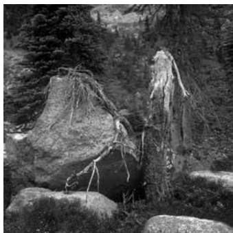
The Rock Garden.