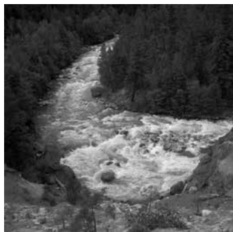
The Stein Valley.