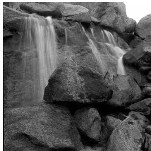
The Rock Garden.