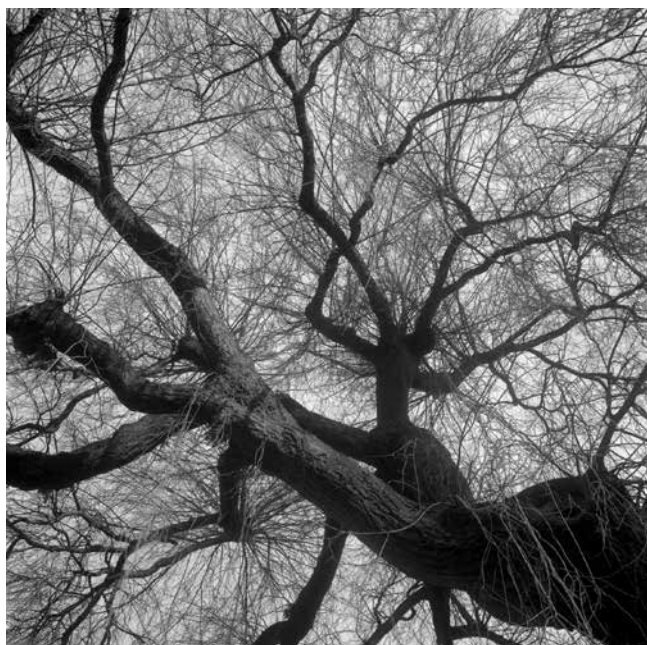
Trees Against a Winter Sky.

The exhibition, called Sticks & Stones , presents his personal work and honours the influence of master photographers Minor White and Edward Weston. Their photographs and writings offered critical encouragement along the way.