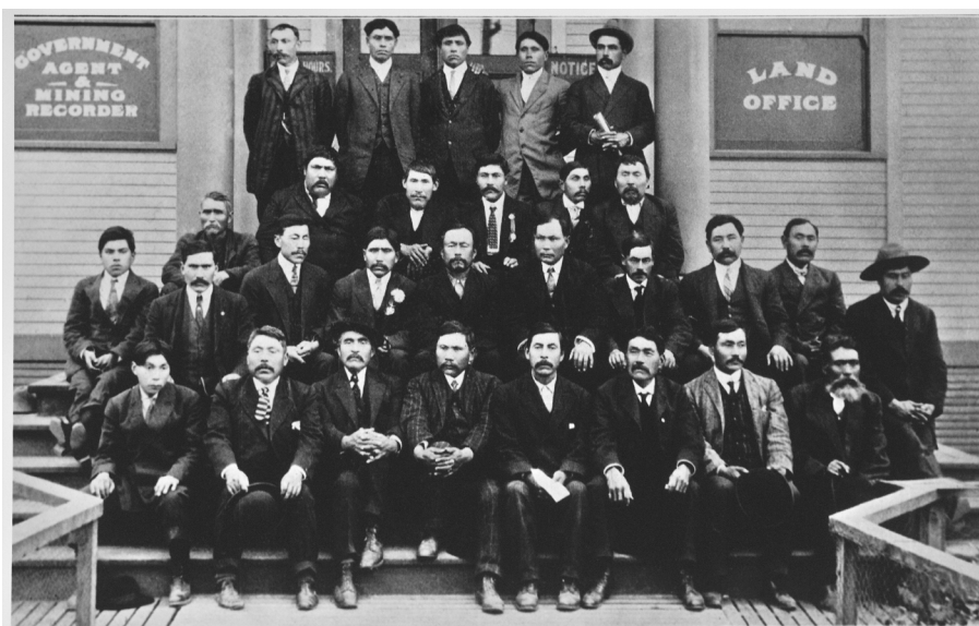
MEMBERS OF THE LAND COMMITTEE OF THE NISGA TRIBE. Photograph taken at Aiyansh, Naas River, upon occasion of a meeting of the Tribe held there in October, 1913.